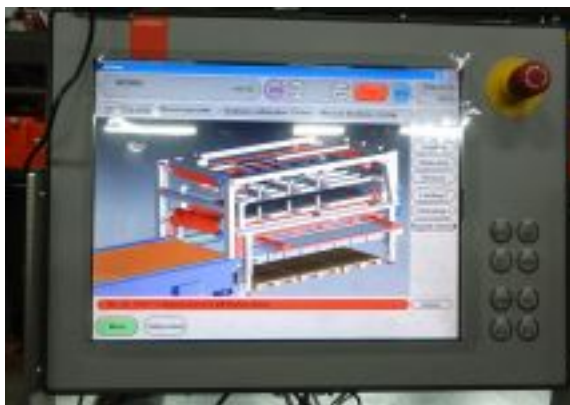
Bystronic ByTrans - CNC steering system View image