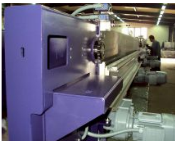
Mounting of the sheet handling system View image