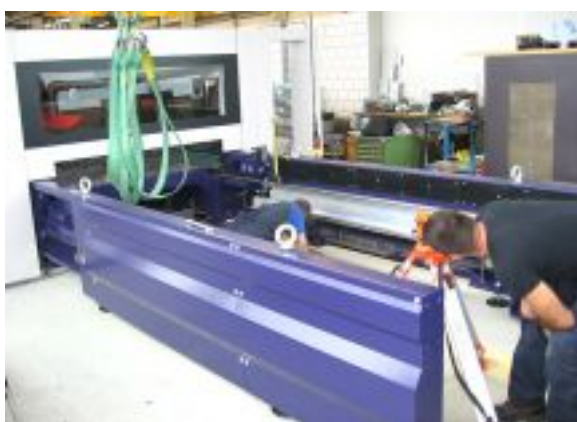
Mounting of the laser cutting machine assembly View image